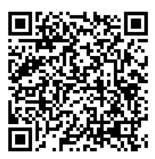
Audio file: Regenpijpklanken

Nieuwstraat runs from the Vest to Voorstraat. First, walk down the downspouts on the right side of the street all together before turning around to do the pipes on the left side. Eventually you will arrive at the point, where you started in the street and that will be the end of your performance. For good measure, it is also possible that the performance is done by two people, one then concentrates entirely on making it sound and the other can then pay full attention to recording the sound.